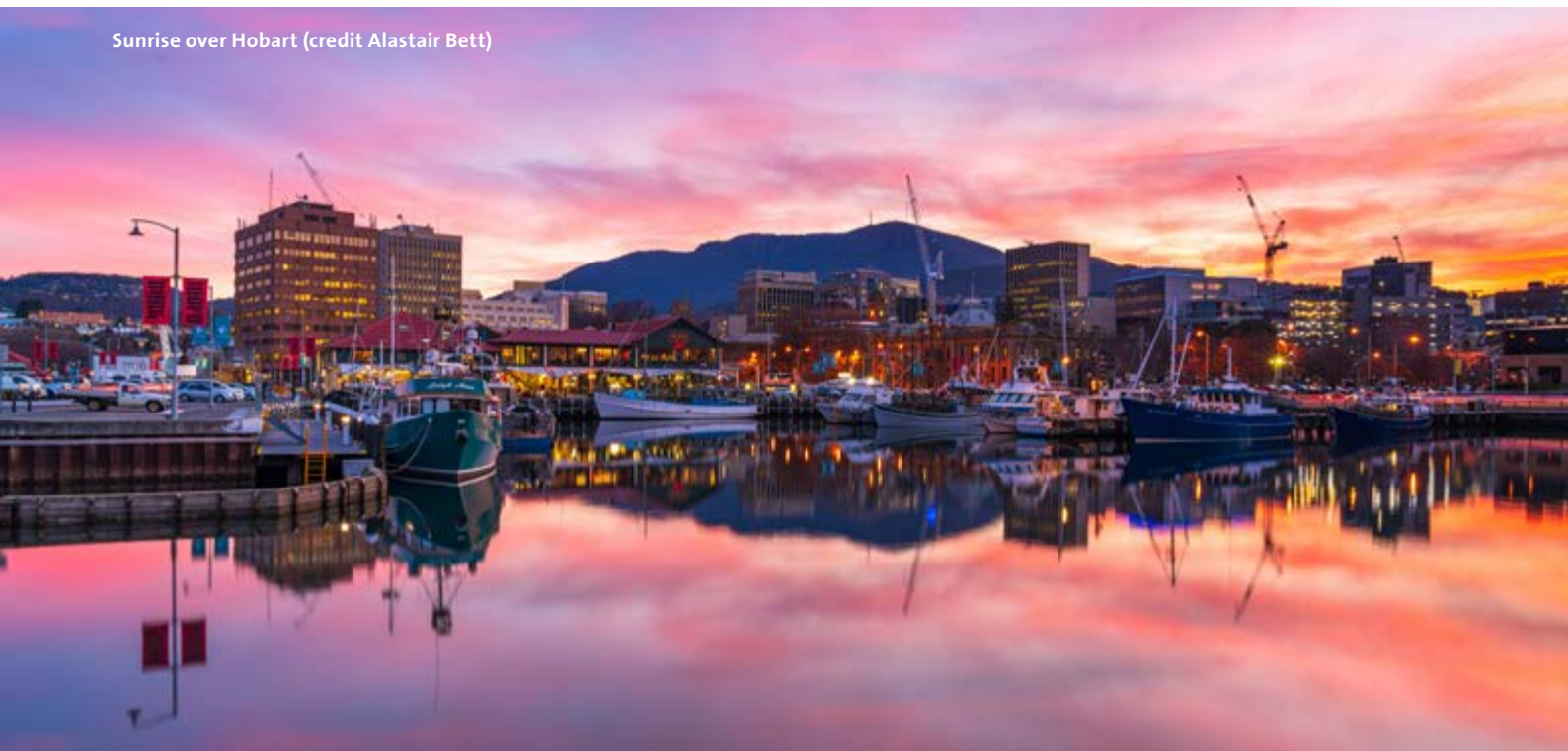
Sunrise over Hobart