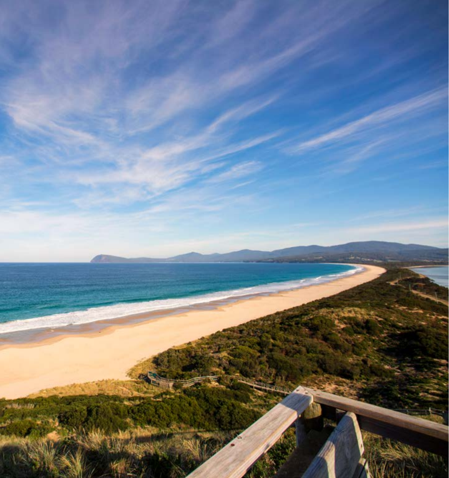
The Neck and Adventure Bay

Australia's only island state is small, but its riches encompass botany, history, natural beauty and cuisine. With a character all its own, Tasmania is the place to reconnect with nature and wildlife, as well as treat your taste buds and hear stories about past and present. Its pristine natural beauty and outstanding local food and wine form an ever-present backdrop to its fascinating culture and history.