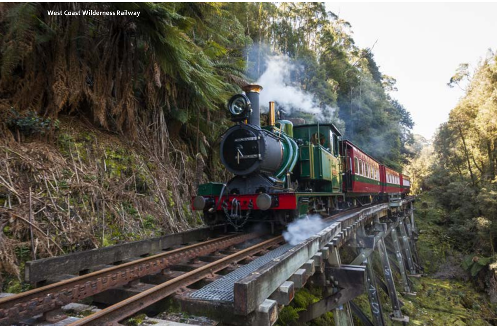
West Coast Wilderness Railway