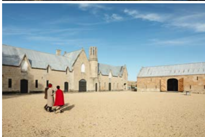
Sunset on Bruny Island (top); Launceston; Cataract Gorge ; Shene Distillery (above)