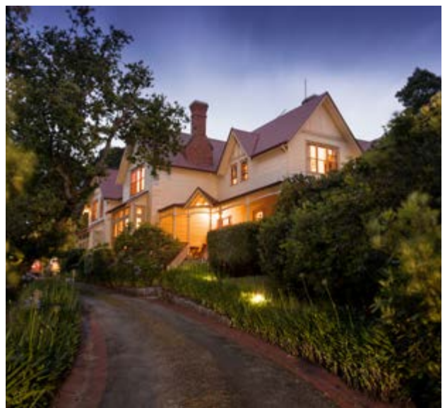
The bar at Hadley's Orient Hotel (top); Franklin Manor; Salamanca Market (below)