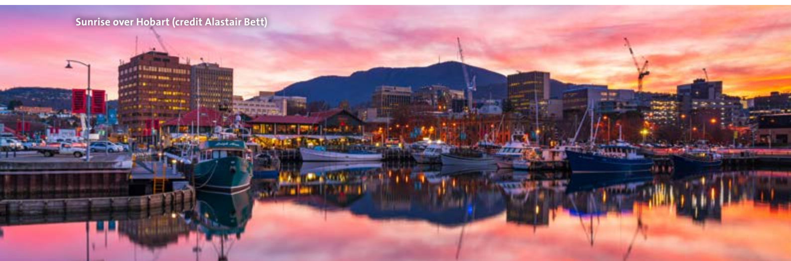
Sunrise over Hobart