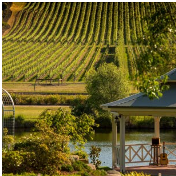
The bar at Hadley's Orient Hotel (top); Josef Chromy Vineyard (above)