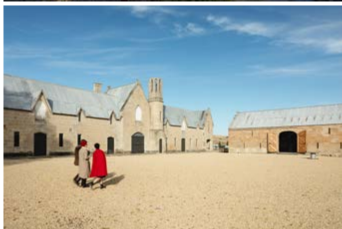
Sunset on Bruny Island (top); Launceston; Cataract Gorge ; Shene Distillery (above)