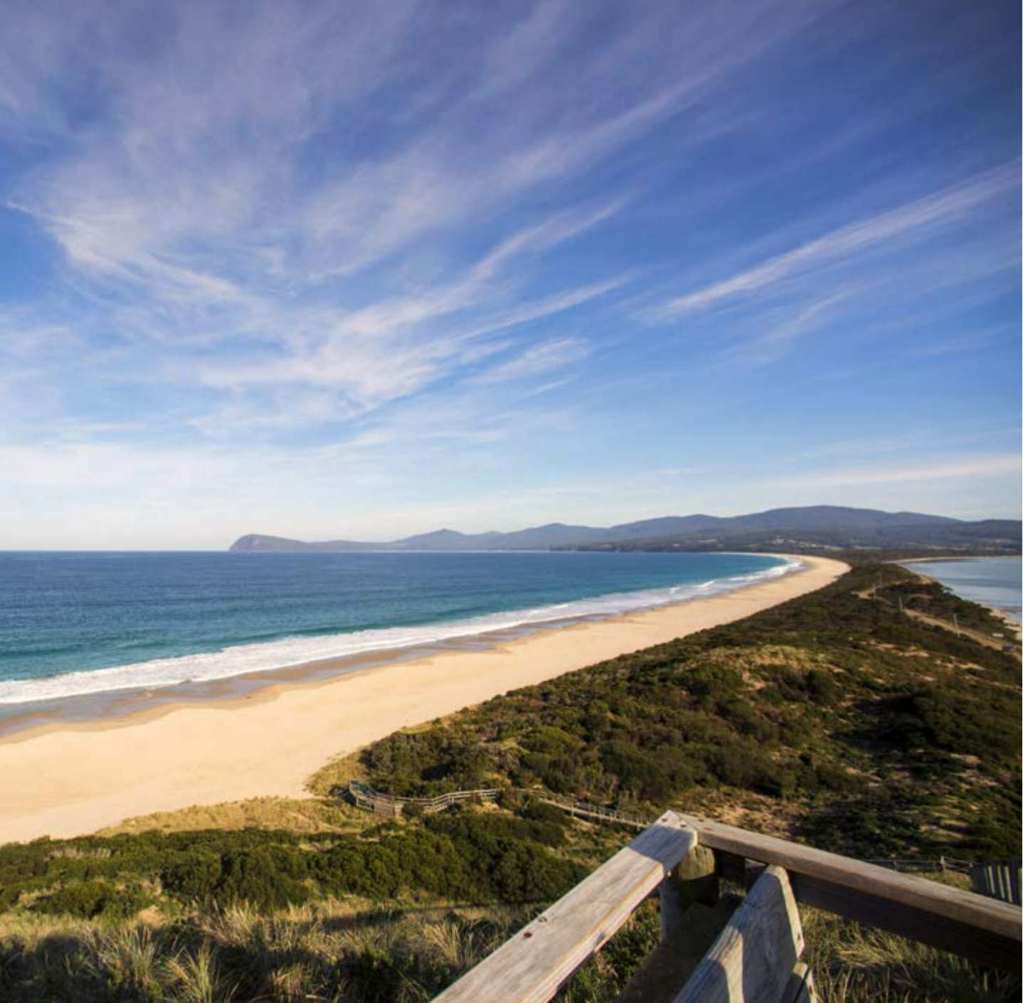
The Neck and Adventure Bay

Australia's only island state is small, but its riches encompass botany, history, natural beauty and cuisine. With a character all its own, Tasmania is the place to reconnect with nature and wildlife, as well as treat your taste buds and hear stories about past and present. Its pristine natural beauty and outstanding local food and wine form an ever-present backdrop to its fascinating culture and history.