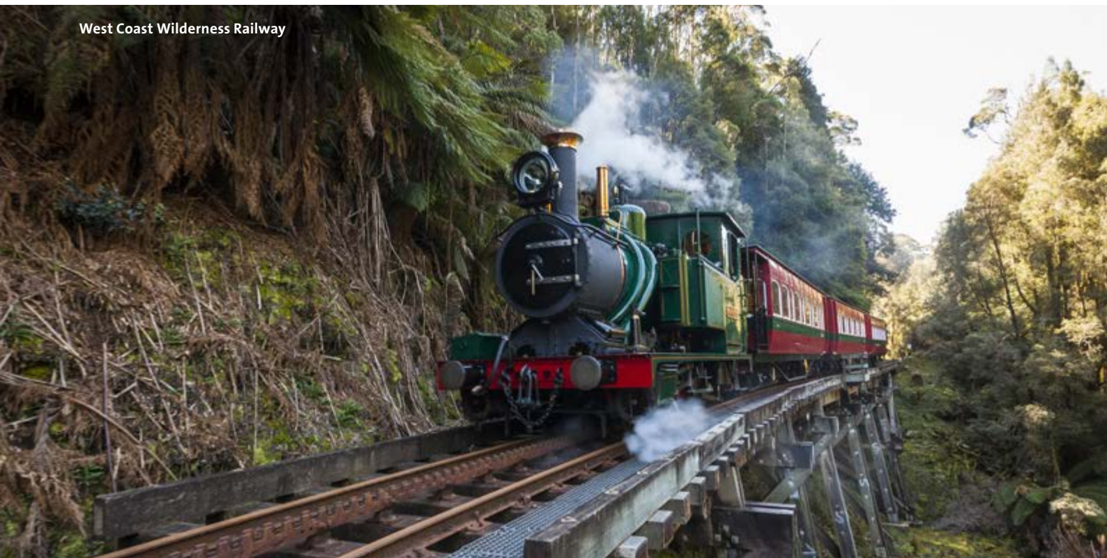
West Coast Wilderness Railway

Isabel Sloman, participant Tasmanian Heritage Tour, April 2021