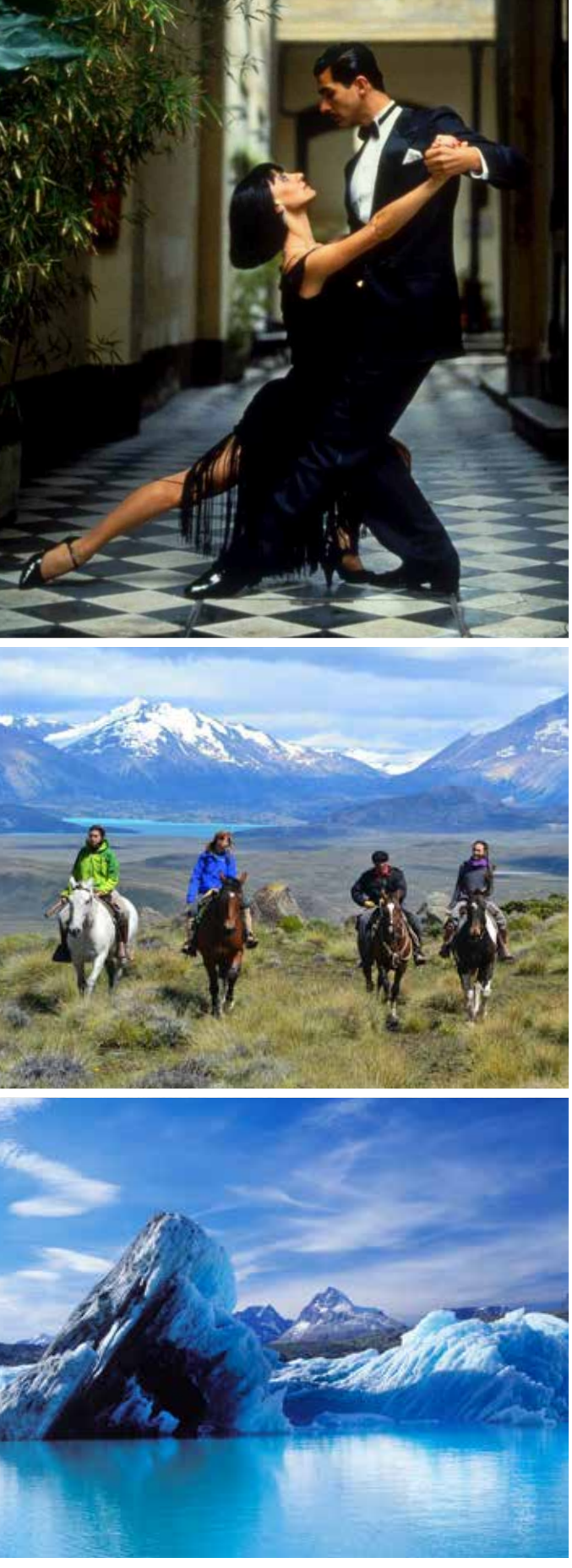
Tango in Buenos Aires (top); Horse riding in Bariloche; Upsala Glacier (above)

Jon Baines Tours (Melbourne) PO Box 68, South Brunswick, Victoria 3055 Tel: +61 (0) 3 9343 6367 Fax: +61 (0) 3 9012 4228 Email: info@jonbainestours.com.au www.jonbainestours.com