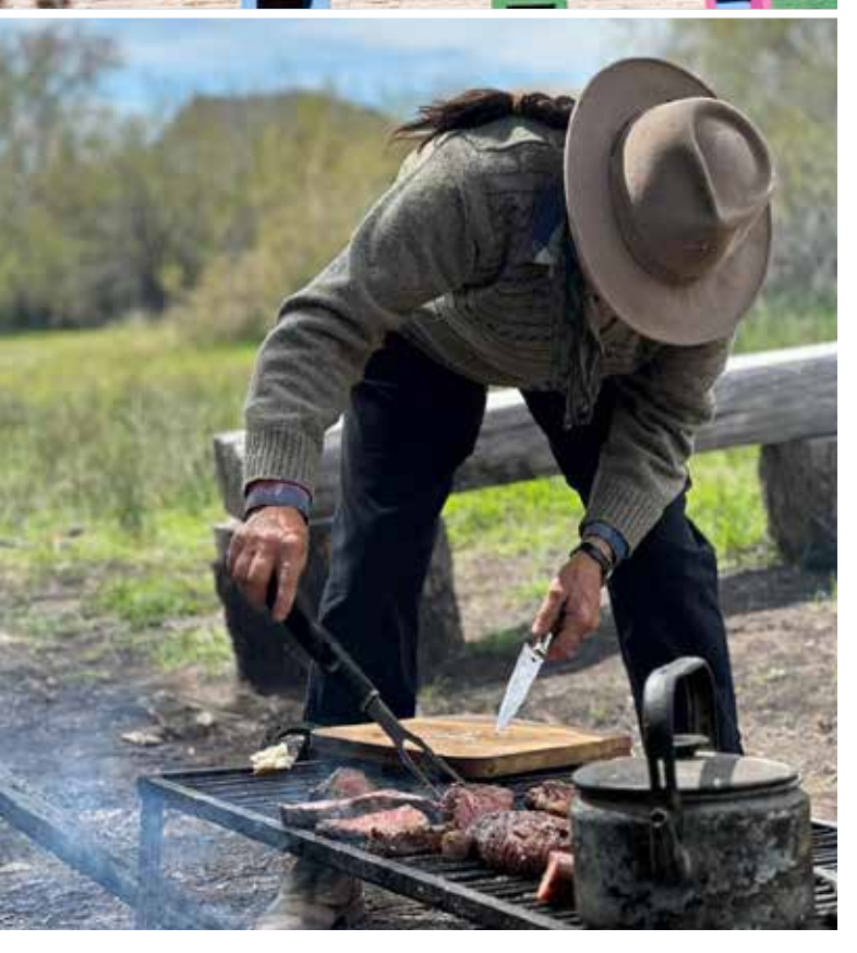
A toucan in Iguazú (top); La Boca, Buenos Aires; Enjoy a gaucho lunch (above)