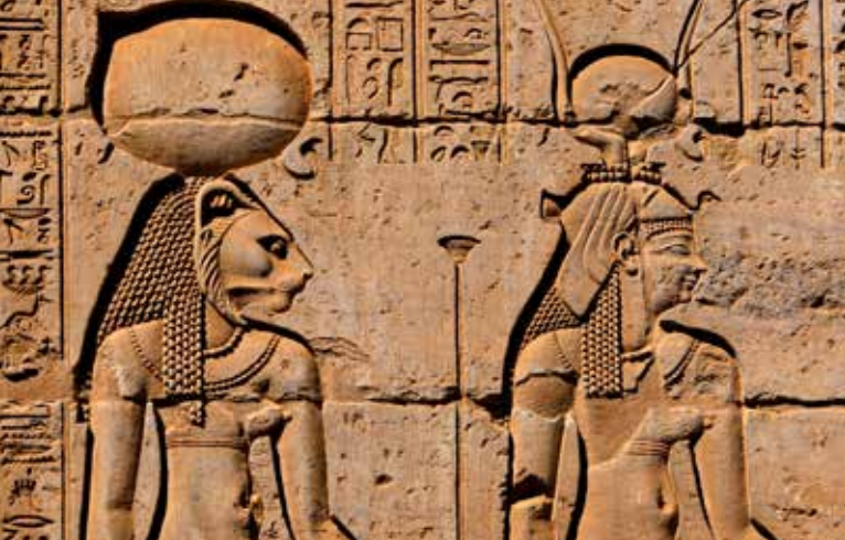
Hieroglyphics at Kom Ombo Temple