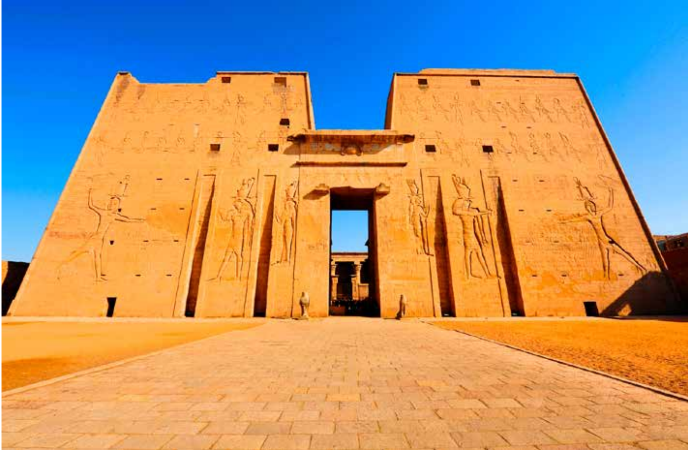
The Temple of Edfu