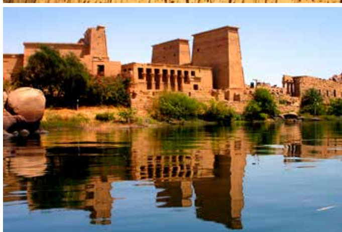
The rooftops of Cairo (top); Abu Simbel; Karnak Temple, Luxor; Philae Temple, Aswan (above)