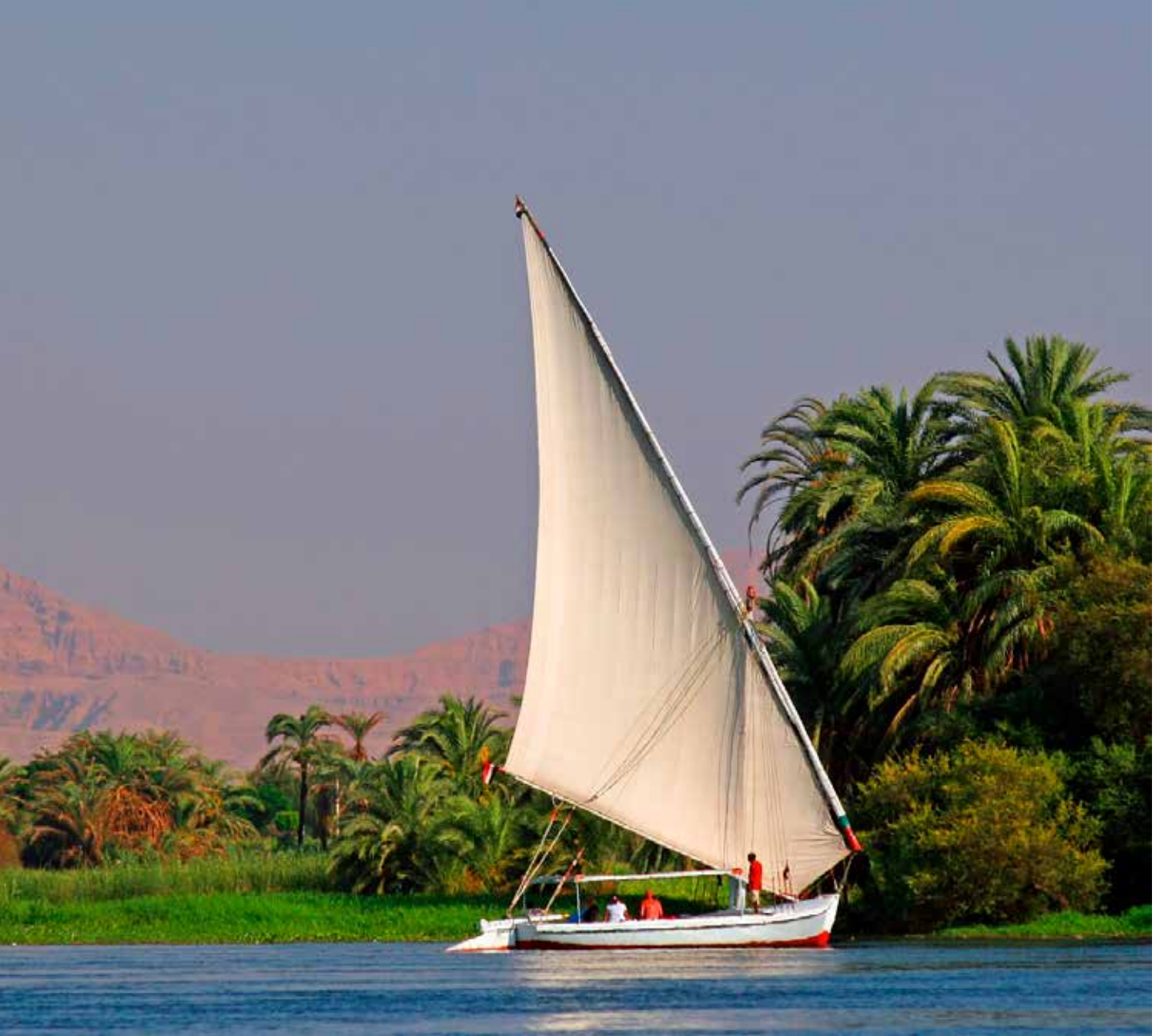
Felucca on the River Nile, Aswan

The Nile has been the repository of stories for millennia. Hear these ancient tales as you cruise in comfort to Egypt's most fascinating destinations, learning about Egyptian history of medicine aboard the deluxe MS Jaz Regent river cruiser.