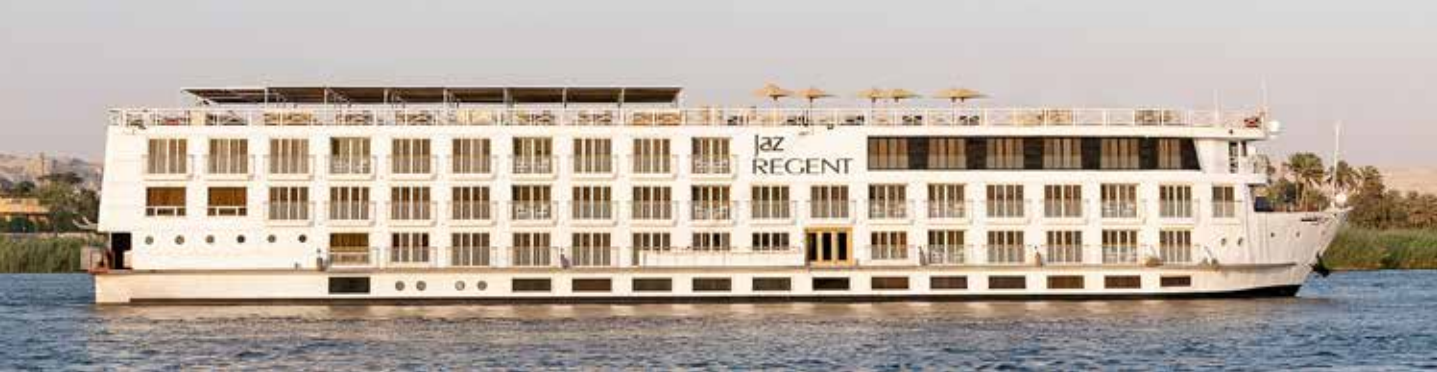
The Jaz Regent river cruise ship