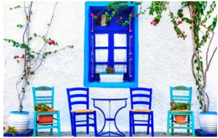
Castle of the Knights, Rhodes old town (top); Rhodes Harbor gates and lighthouse; A street in Rhodes old town; A classic Greek café (above)