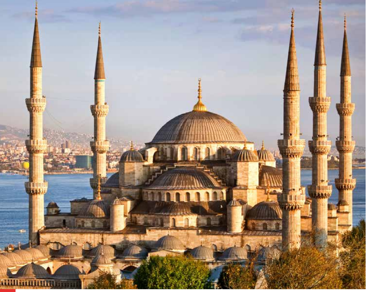
The Blue Mosque in Istanbul

History, nursing and culture intertwine on this journey through Turkey and the Greek island of Rhodes. It would be hard to find such a concentration of historically significant nursing and medical sites anywhere else, amidst some of the richest culture and history in the world.