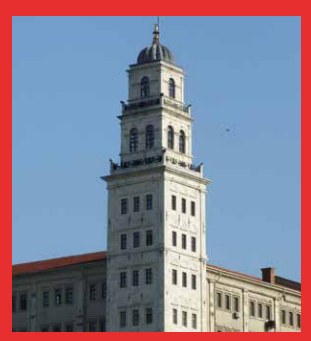
The Nightingale Museum at Scutari

NB: All itineraries in Turkey and Greece are subject to change according to local conditions. Places on this tour are strictly limited.