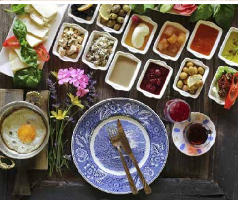
The Grand Bazaar, Istanbul (top); Anzac Cover, Gallipoli; A typically delicious Turkish spread (above)