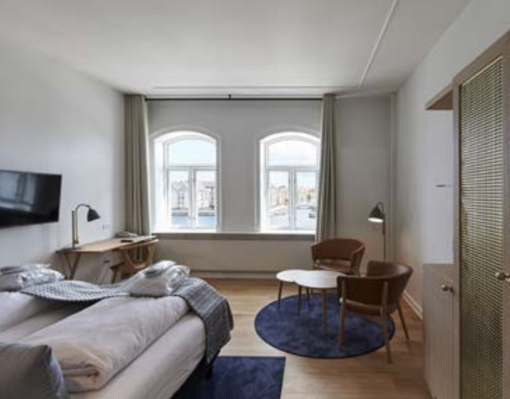
Executive twin room at Copenhagen Strand Hotel