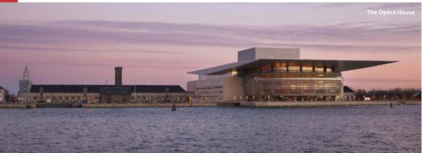
The Opera House

With more Michelin starred restaurants than any other Scandinavian capital, Copenhagen also provides a wide range of exciting new eateries plating produce from local greenhouses, gardens and farms. Filled with art and culture, stunning modernist architecture, beautifully preserved historic quarters and fine dining, Copenhagen is a delight to explore over a weekend.