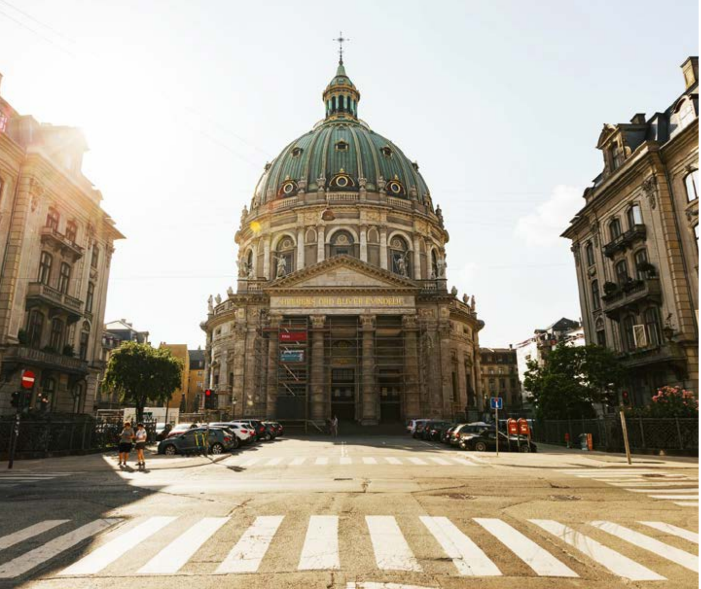
The Marble Church

Copenhagen is a city of constant visual pleasure, where an everyday walk provides a sense of quiet wonder. This compact, easy-to-navigate city is effortlessly stylish in an understated, clean edged way. It is also one of the world's most liveable cities with eco-design around every corner and welcoming and courteous citizens who are the epitome of Scandi cool.