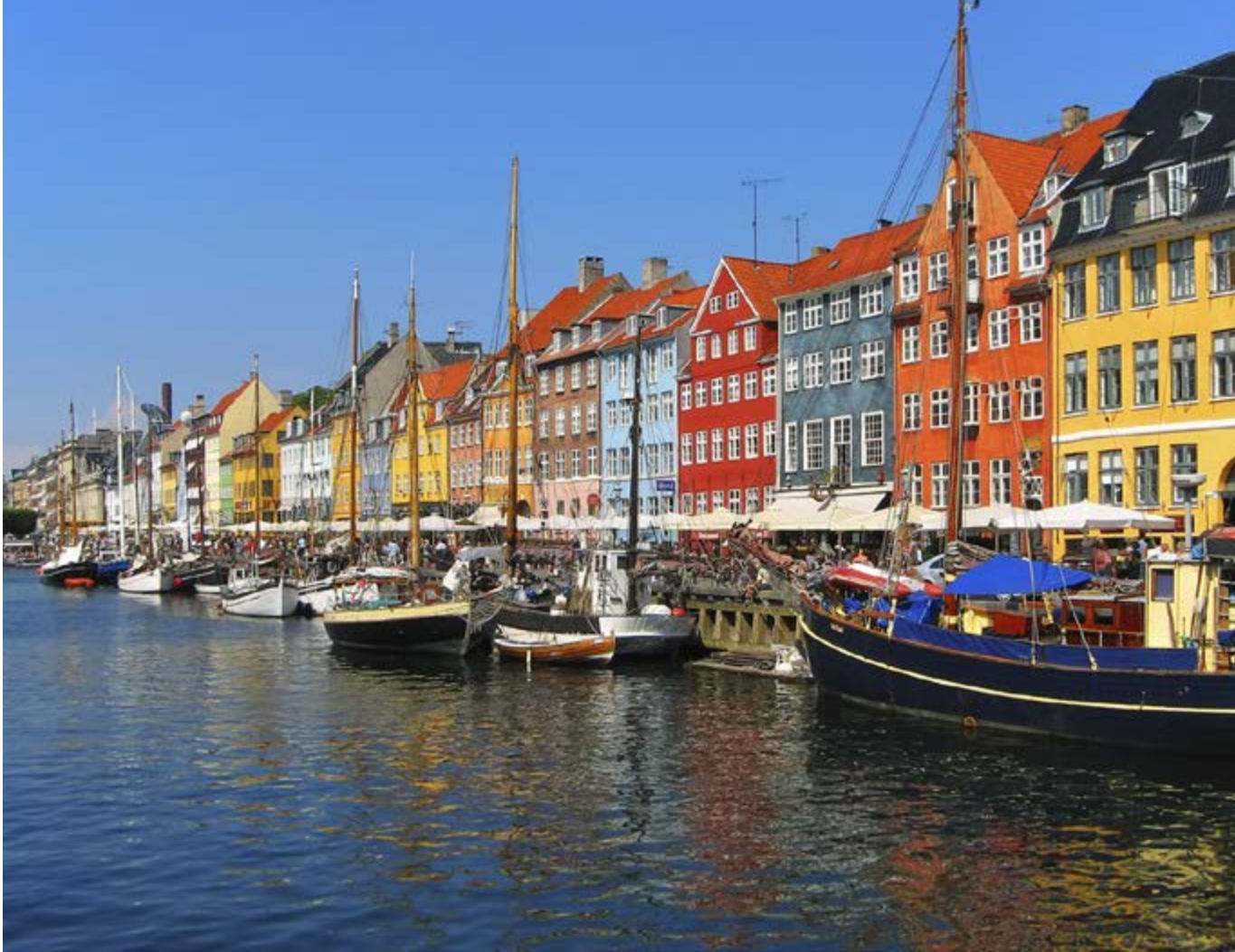
The beautiful waterfront at Nyhavn